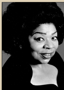
Martina Arroyo Metropolitan Opera Soprano Artistic Director Distinguished Professor Emerita

The program will be under the direction of Martina Arroyo, President of the Martina Arroyo Foundation, Inc. The staff will include experts in the following areas: opera history, vocal coaching, stage direction and language coaching.